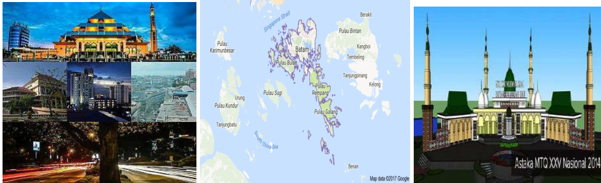
Figure 3. Batam City

The Goodness of Fit Index is as shown in the figure above. The details can be found on Table 2. Observing the cut-of-value and goodness of fit of the model, the results in Table 2 shows that three criteria are considered as good, one as marginal, and one as not good. Criteria met is Chi-square ( c^2 ) Relatives Chi-square ( c^2/ Df ) and RMSEA, GFI and the which is marginally not good is. Because there are three criteria are fulfilled and marginal four of the five criteria required, then the above models can be Expressed as a good example of (Solimun, 2004: 71).